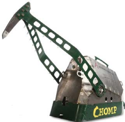
Lesley Bosniack LT Analytics