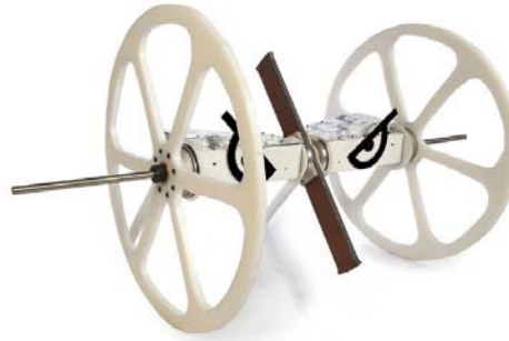
Sean Devlin Swiss Re